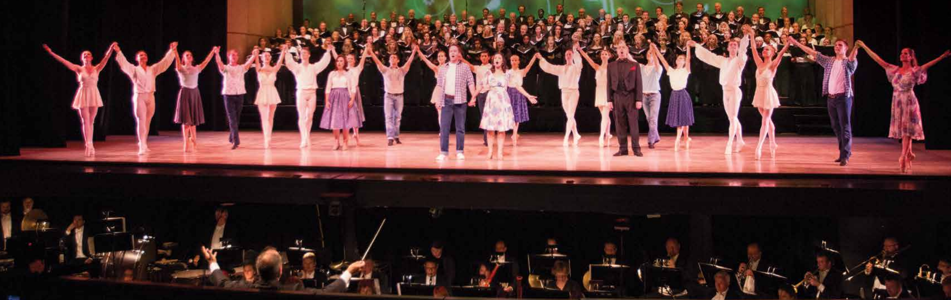
The 2013–2014 Season Opening Spectacular featured all three art forms on one program for the first time. Pictured is the grand finale, “Make Our Garden Grow.”

Achieving our vision and purpose requires determined leadership and commitment.