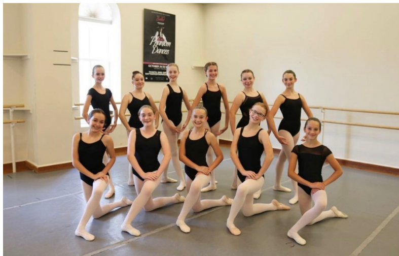
Dayton Ballet II Junior Company