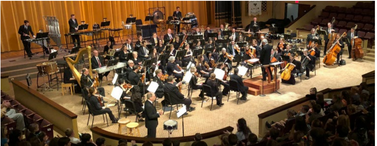
Dayton Philharmonic Orchestra