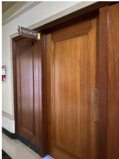
Main floor restrooms

All of the restrooms are automatic flush and have paper towels that I can use to dry my hands. If people have to use the restroom, I may have to wait in line. I will try to be patient and wait my turn.