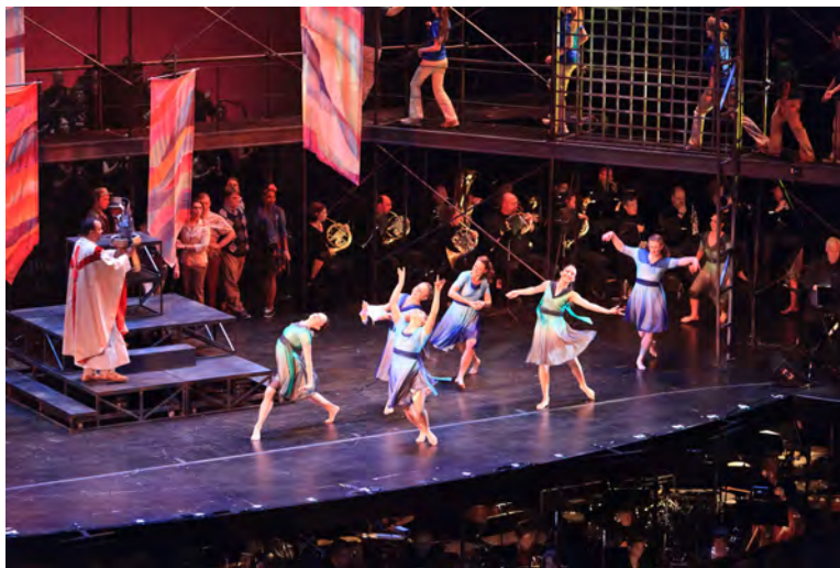
Offertory (De Profundis, Part 2)