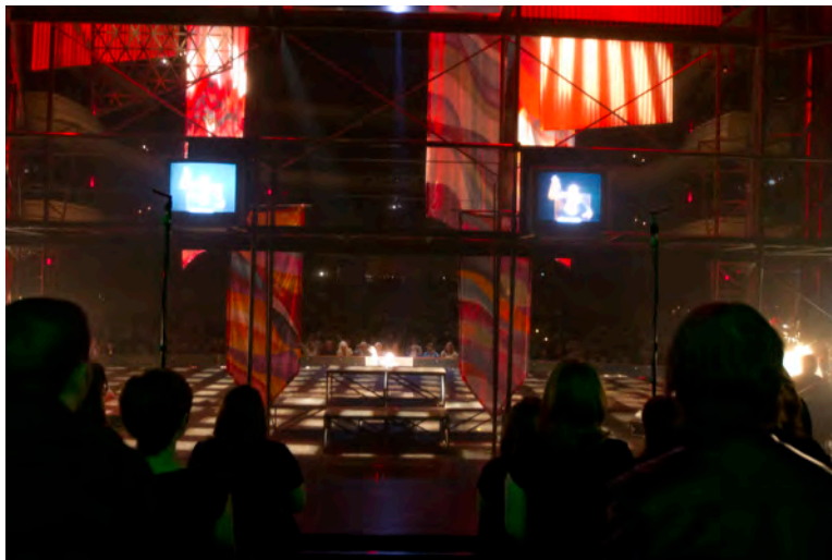
Wright State Chorale Singers, Ready for Showtime