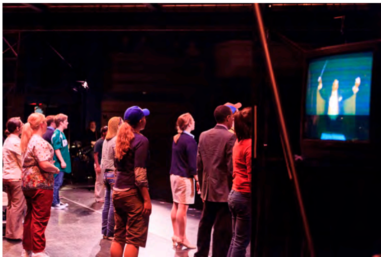
Communion: "Secret Songs"