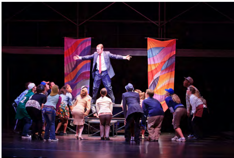
Gospel Sermon: "God Said"