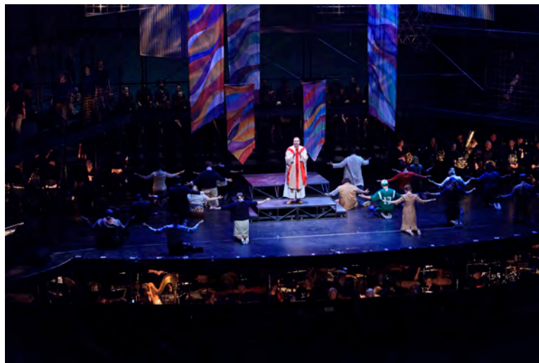
Meditation No. 3 (De Profundis, Part 1)