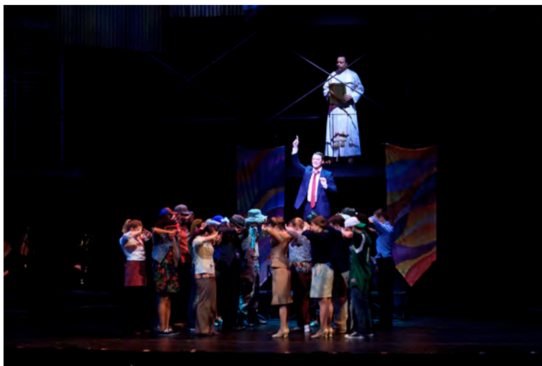
Gospel Sermon: "God Said"