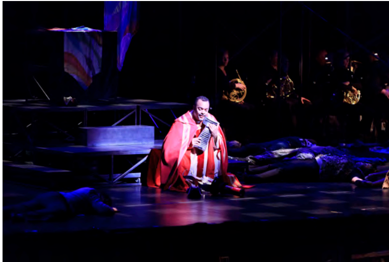
Fraction: “Things Get Broken”