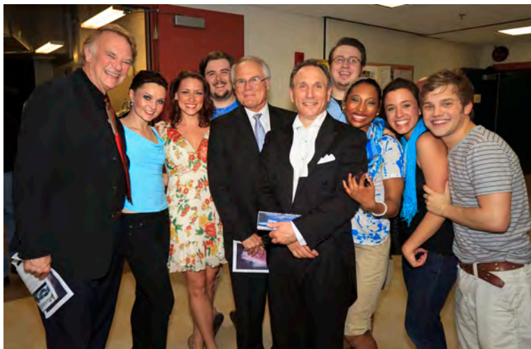
Time for the Cast Party!