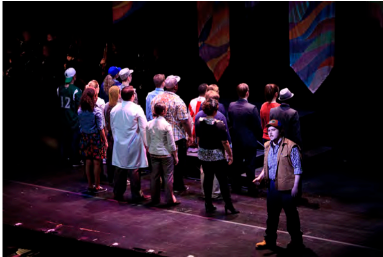
Trope: Non Credo