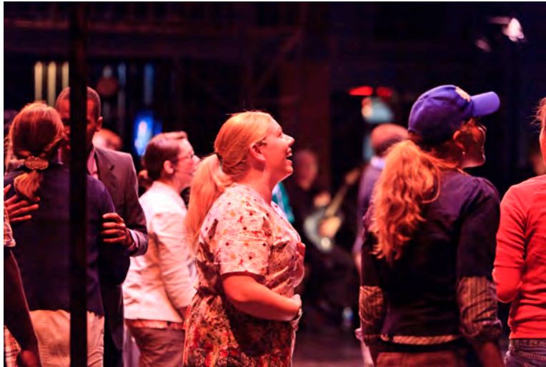
Communion: "Secret Songs"