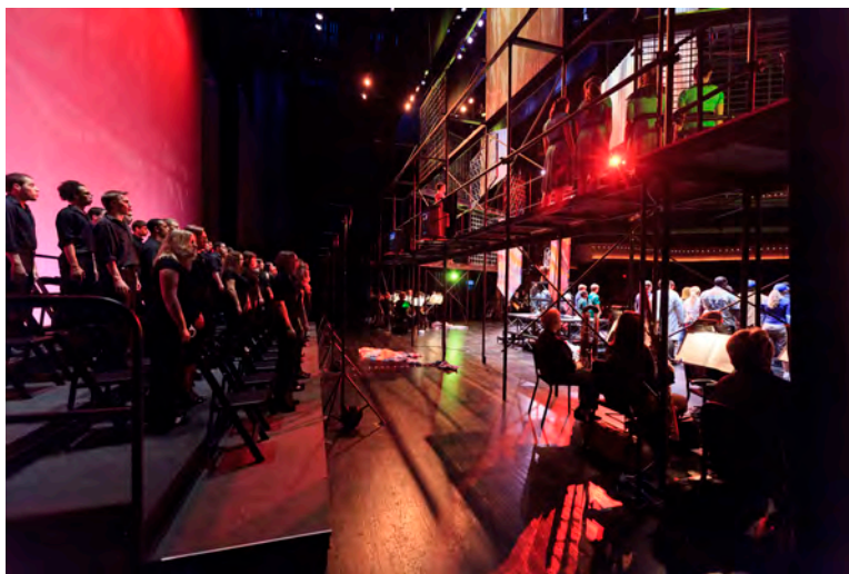
Communion: "Almighty Father"