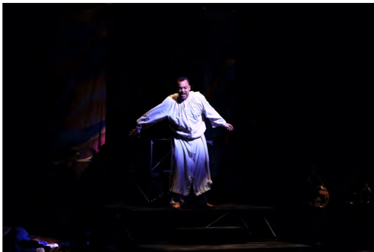
Fraction: “Things Get Broken”