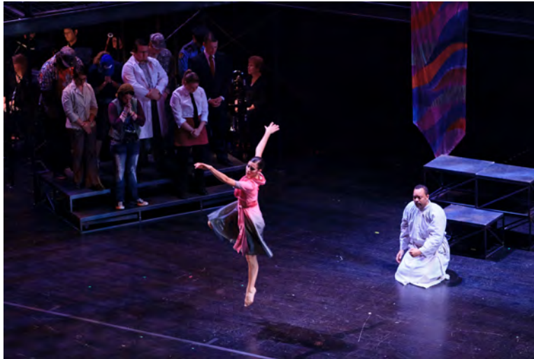
Meditation No. 2