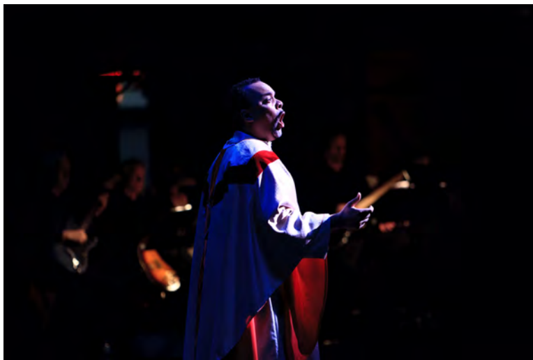
Our Father/Trope: "I'll Go On"