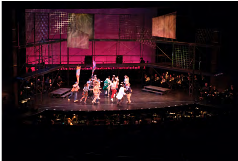
Gloria in Excelsis