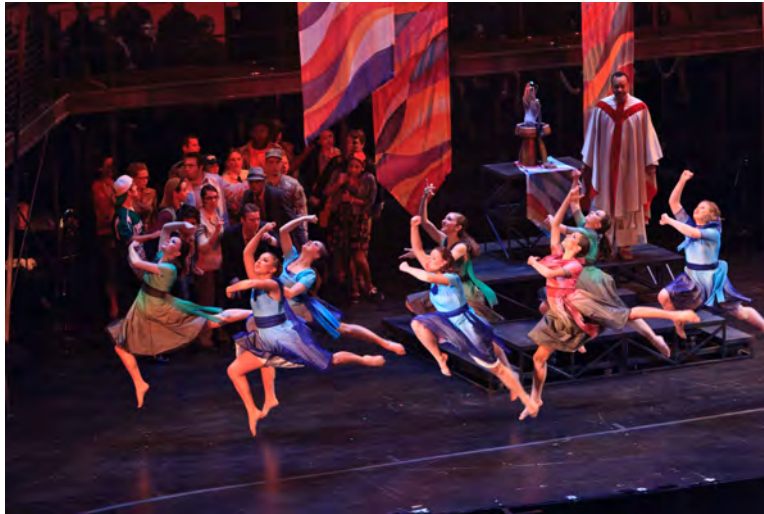
Offertory (De Profundis, Part 2)