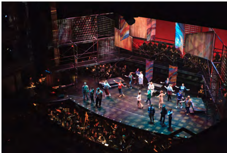
Gloria in Excelsis