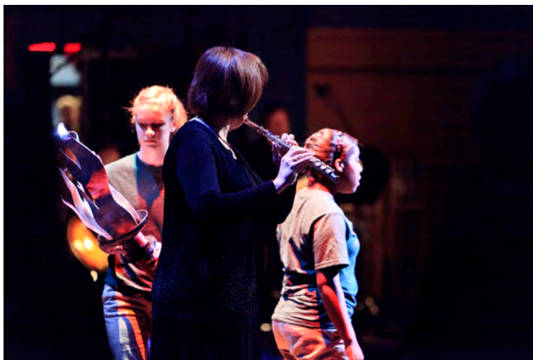
Communion: “Secret Songs”