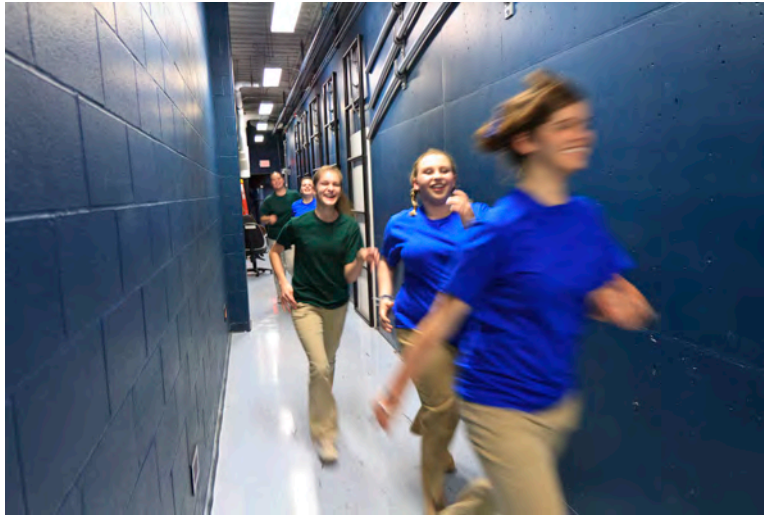
Members of the Kettering Children's Choir on a Fast Cross-Over